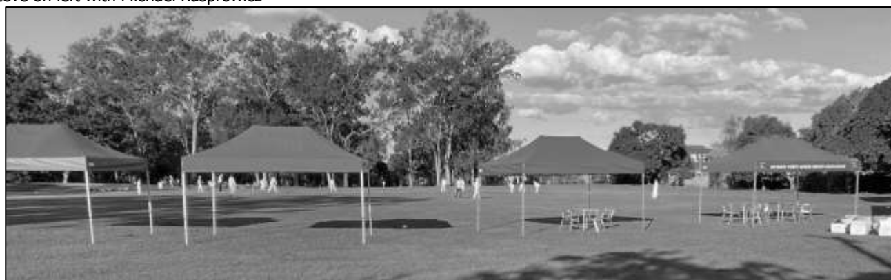
New shade shelters, tables and chairs for Kalinga Park