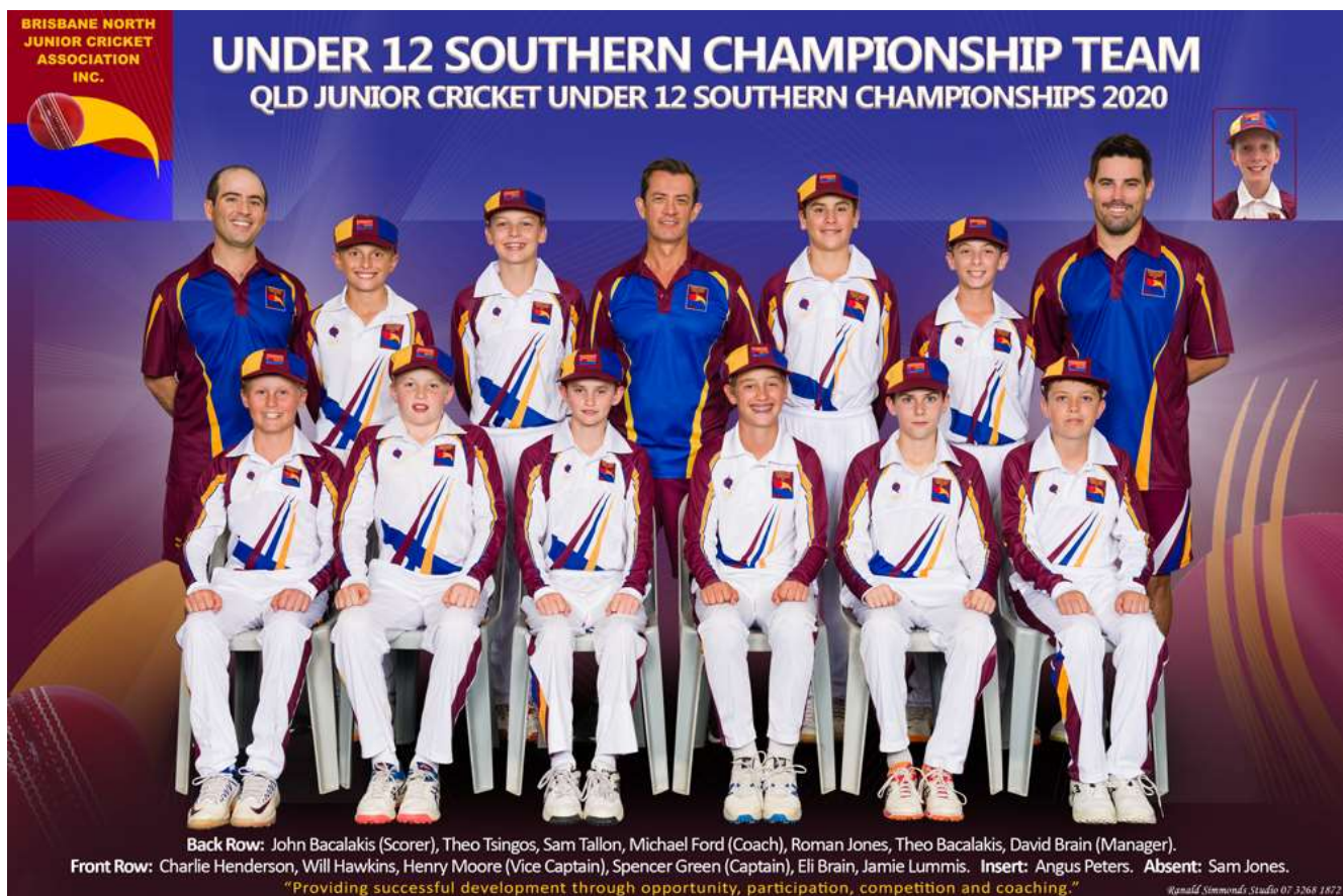
U12 Championship team