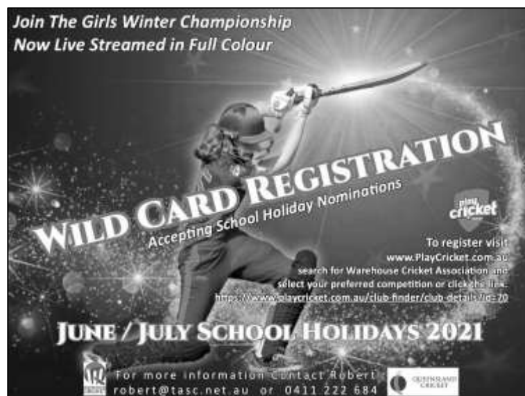
The Winter Warehouse Female cricket was telecast live with BNJCA Frogbox on YouTube.