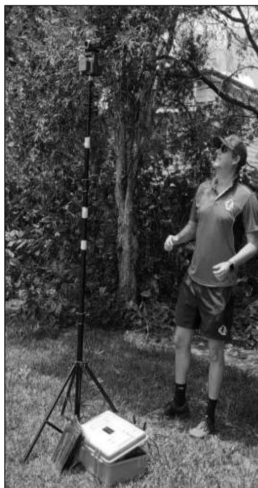
One of our 8 Frogbox camera units, setup to catch the action. The cameras are available for hire from BNJCA.