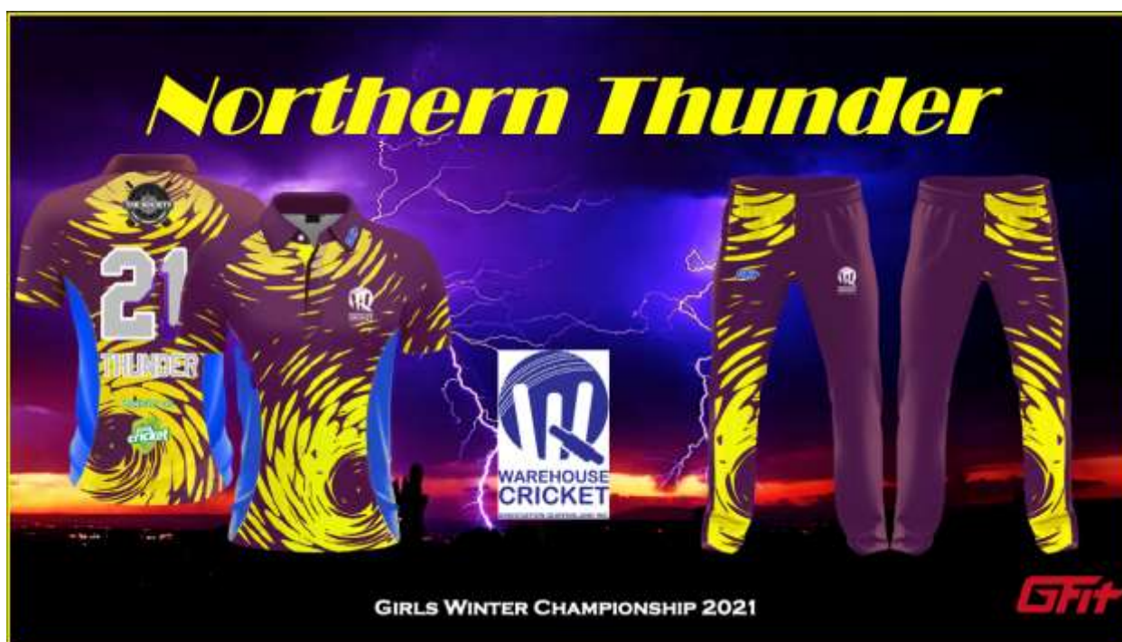
Above: Our BNJCA girls winter warehouse kit for 2021