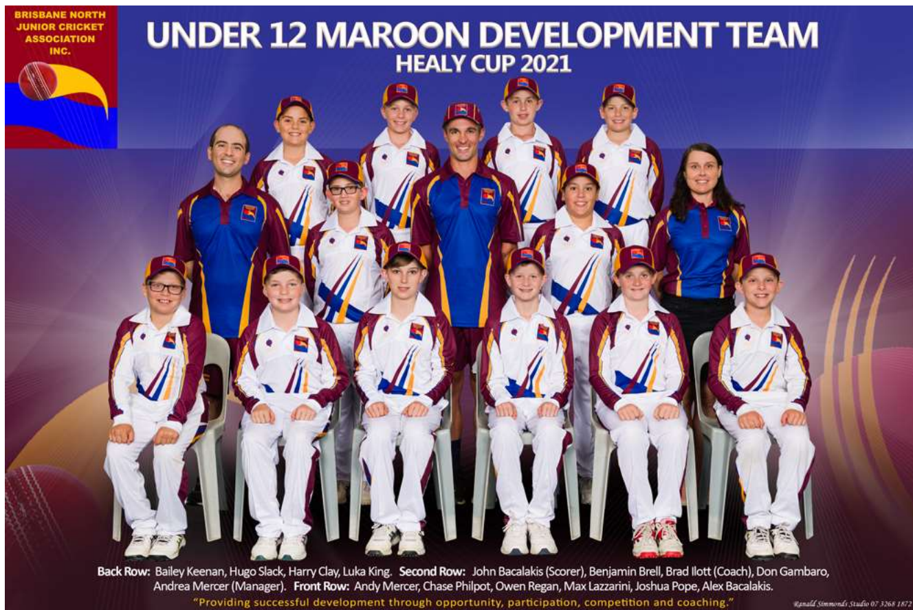
U12 Maroon Development team