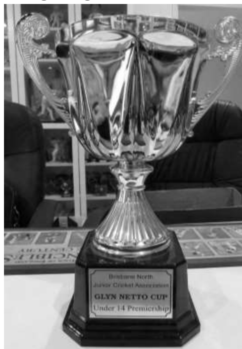
Glyn Netto Cup winners U14