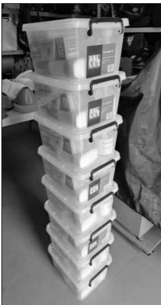
COVID Cleaning Kits at clubs ready for the start of the 20-21 season