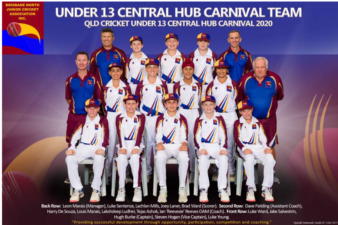
U13 Central Hub Challenge team