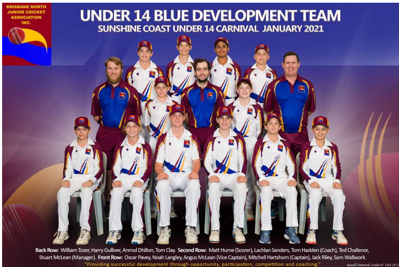
U14 Blue Development team