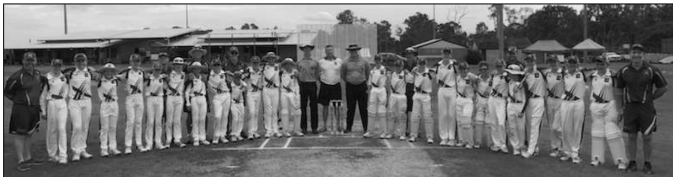
U13 Ipswich BNJCA teams – Blue (left) and Maroon