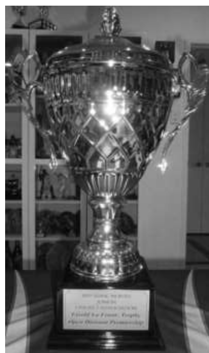
Errol La Frantz Cup winners OPEN