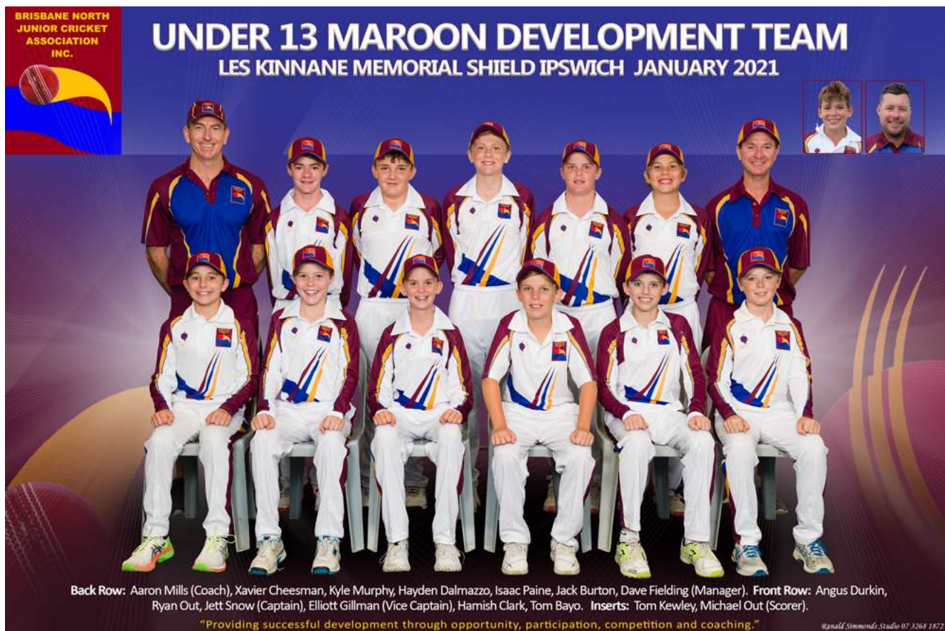
U13 Maroon Ipswich Development team