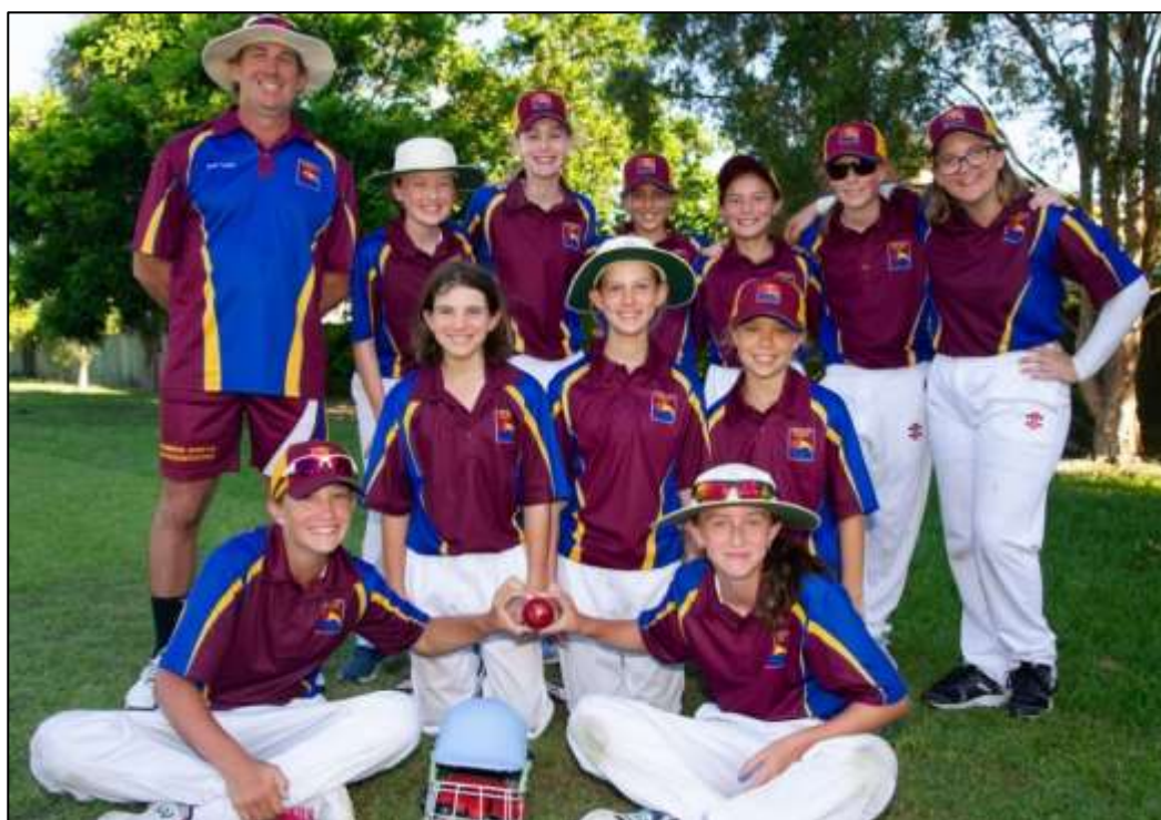
U13 Female Maroon Lord Mayors Cup team