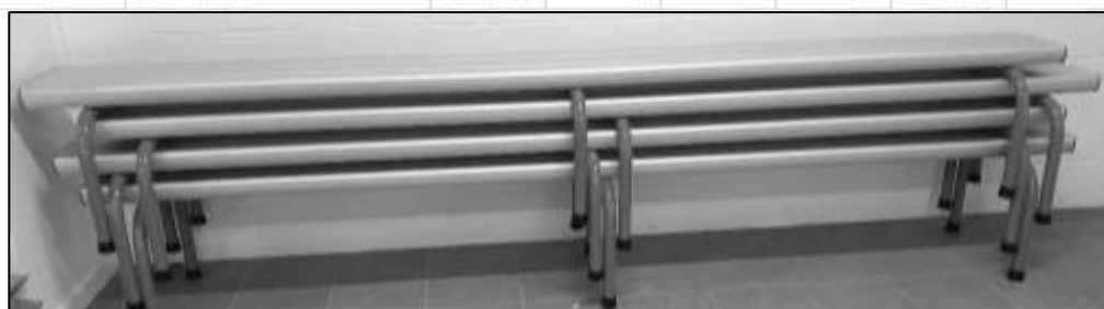
New aluminium benches bought for the change rooms at the Bertha St building.