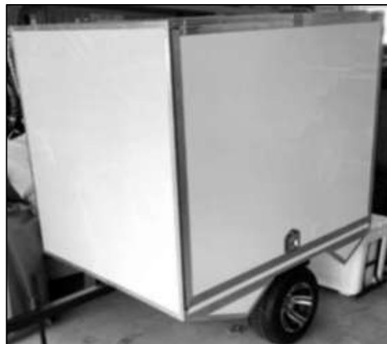
Our new transport at Kalinga Park, golf buggy and trailer, for moving equipment and food & drink