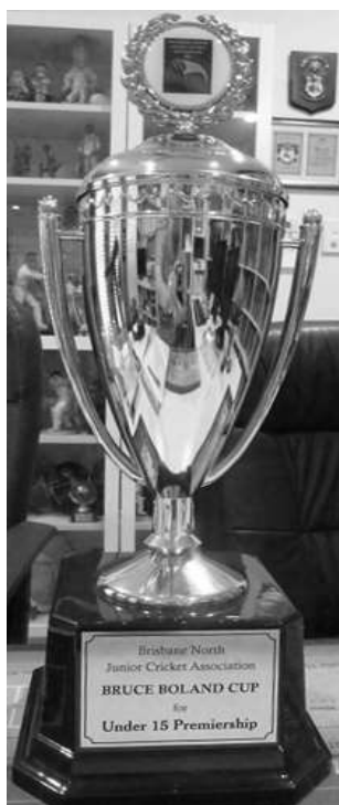
Bruce Boland Cup winners U15