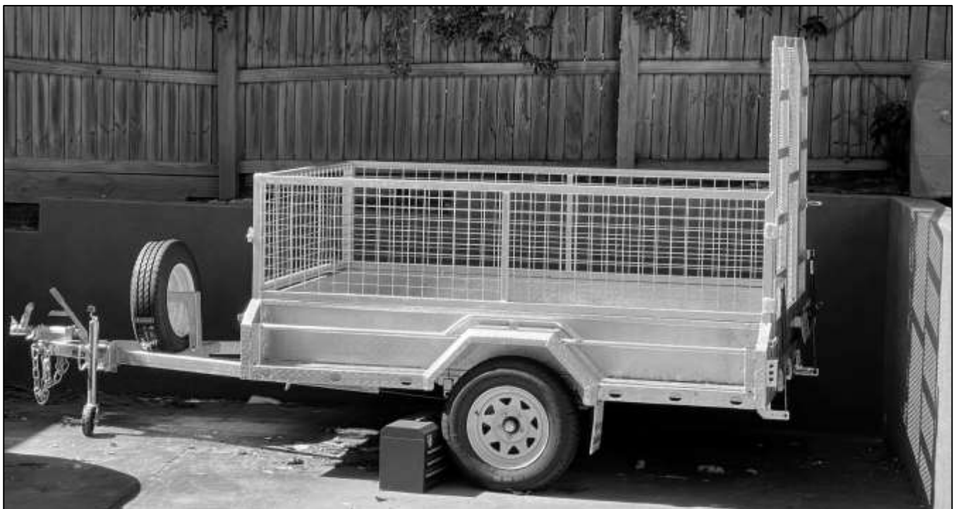
Our new trailer for hauling the oval mower around at Kalinga Park.