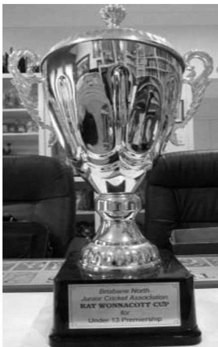
Ray Wonnacott Cup winners U13