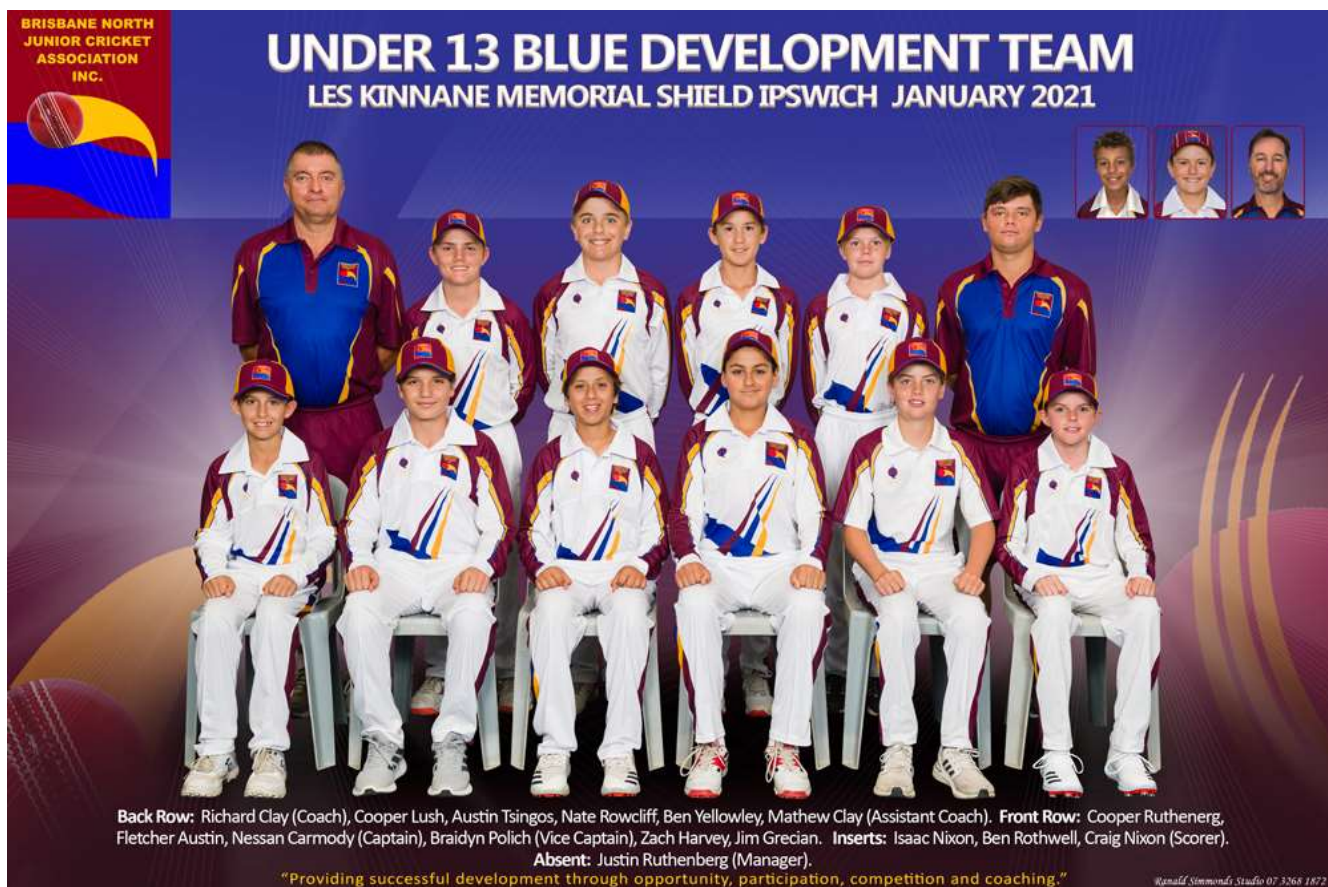
U13 Blue Ipswich Development team