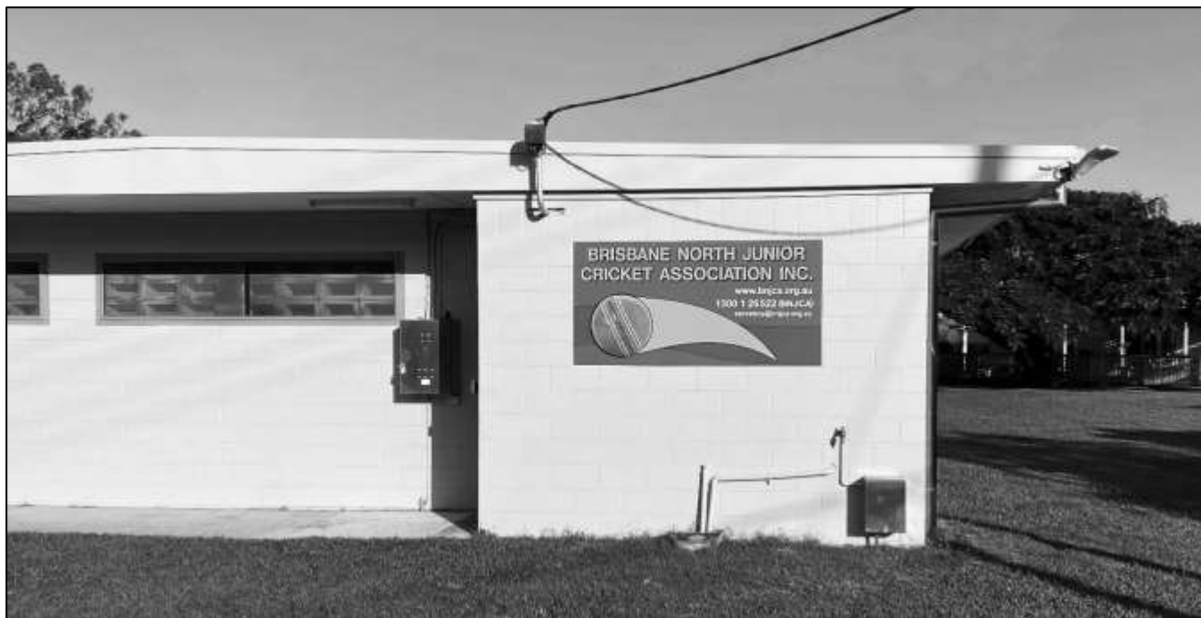
The canteen became operational this season from January 21