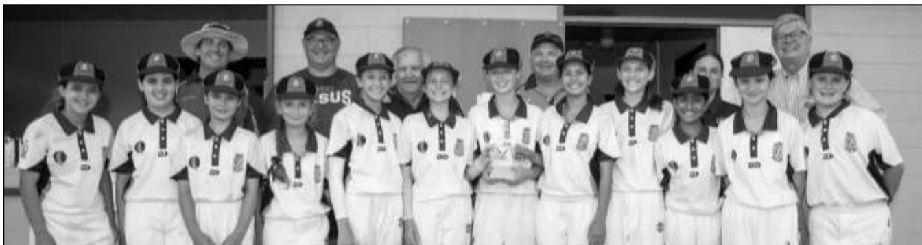
BEARS – Winners of the inaugural Girls U13 2021 Lord Mayor's Cup

An extra special thanks to all of the girls who participated. The growth that was clear to see in all the girls across the course of the 3 days, made every hour spent preparing and running the event worthwhile. Preparations have already begun for next year International and Inter State teams interested in competing in the Lord Mayor's Trophy in 2022!