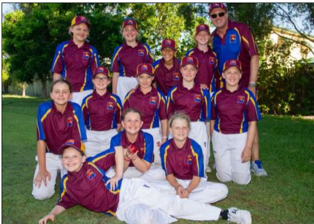
U13 Female Blue Lord Mayors Cup team