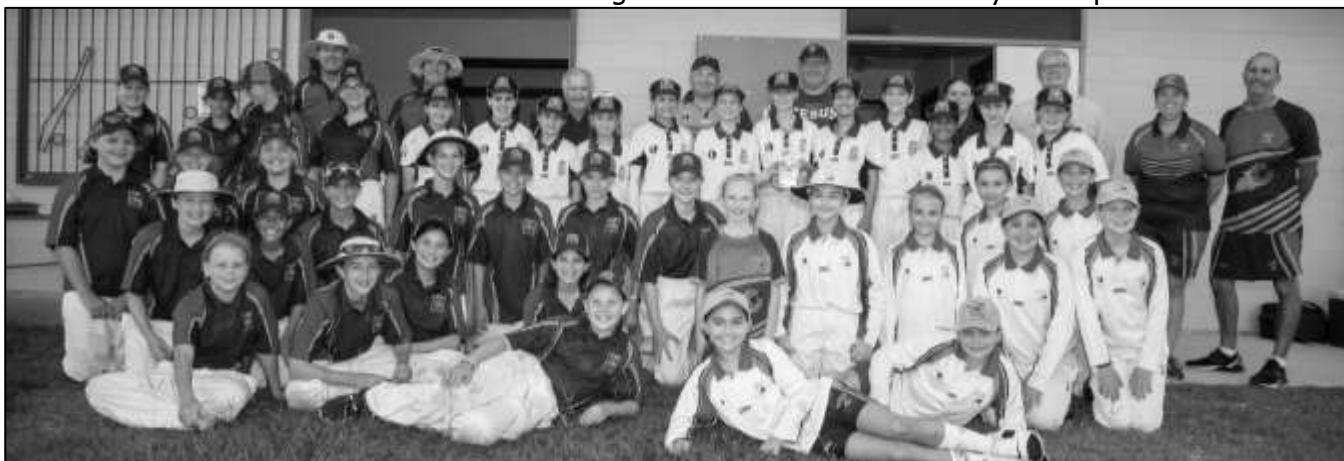
Teams competing in the inaugural 2021 Lord Mayor's Cup