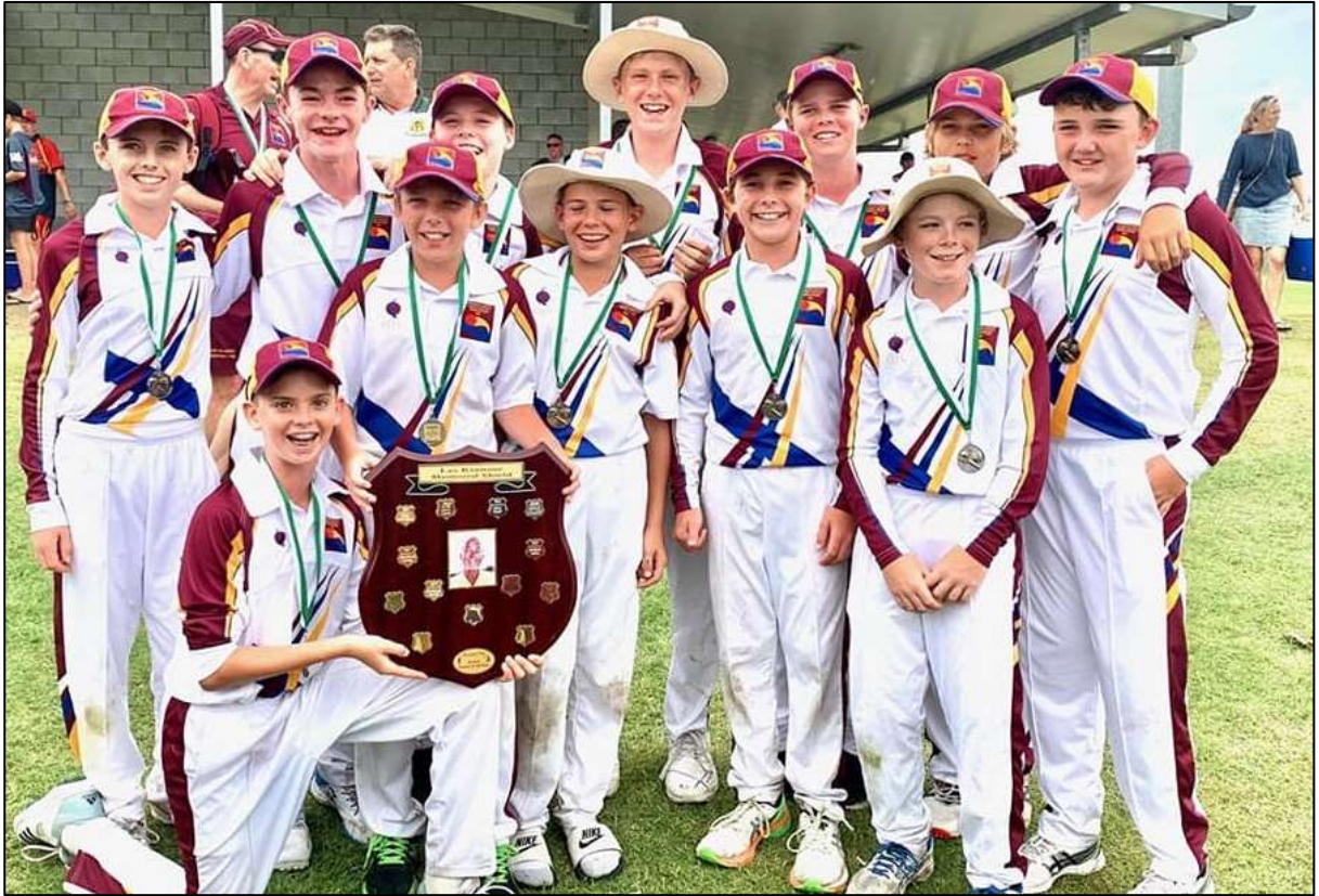
The BNJCA U13 Maroon - Ipswich Les Kinnane Memorial Shield winners