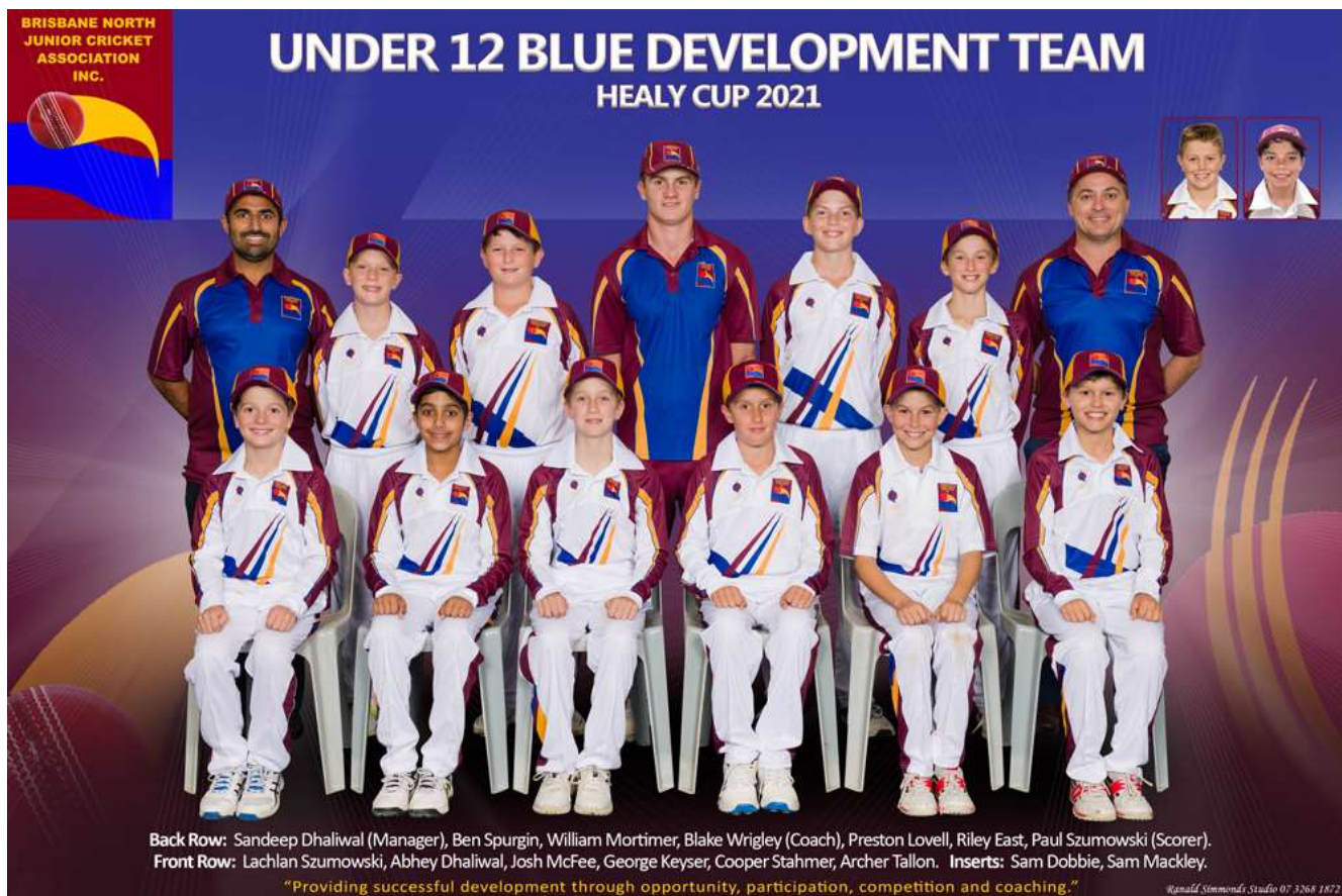
U12 Blue Development team