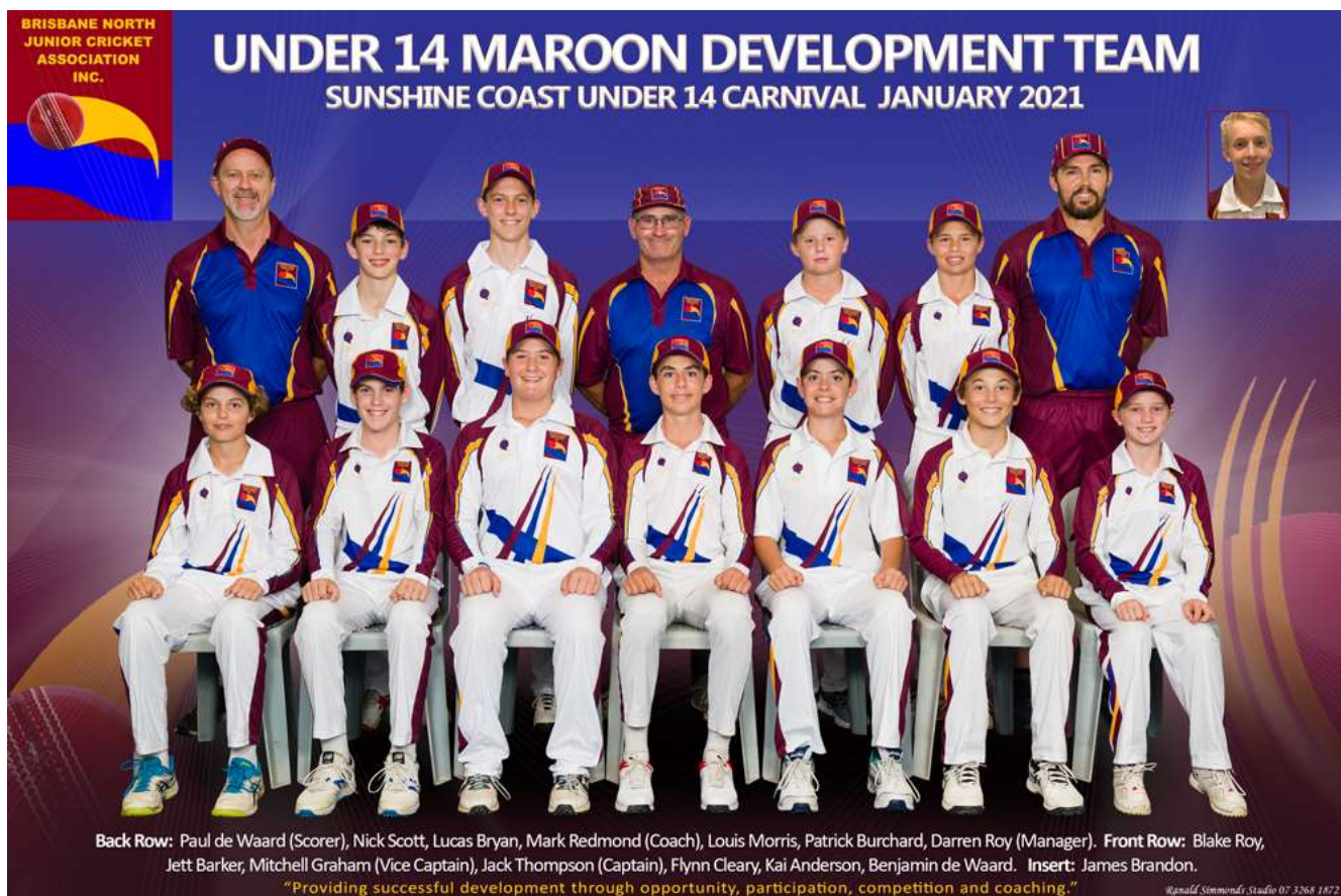
U14 Maroon Development team