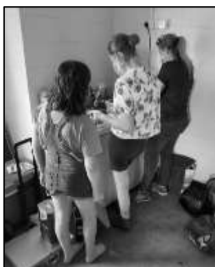
Magnificent work by the canteen ladies at Kalinga