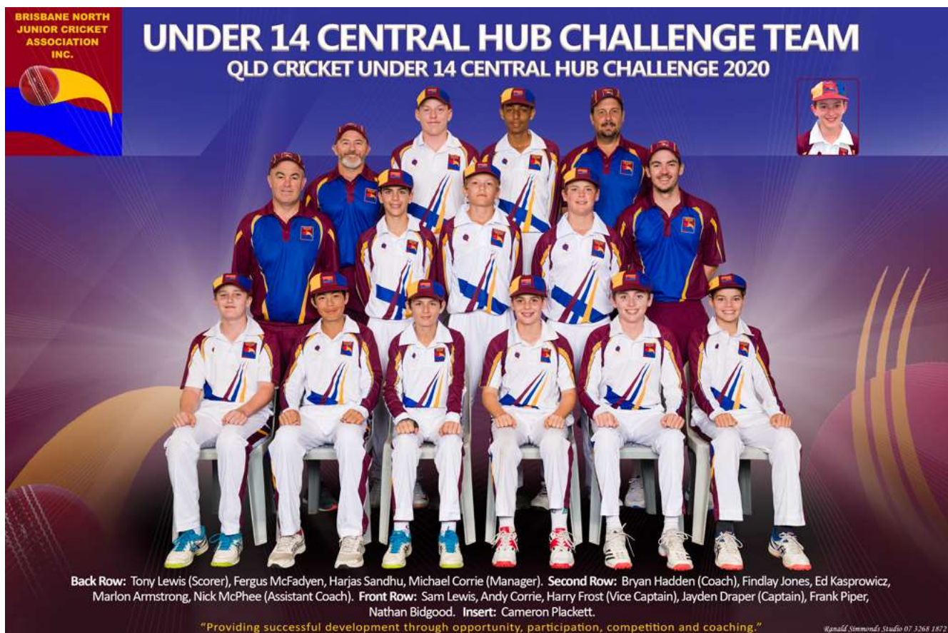
U14 Central Hub Challenge team