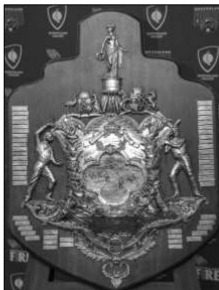
20-21 Sheffield Shield winners - Queensland