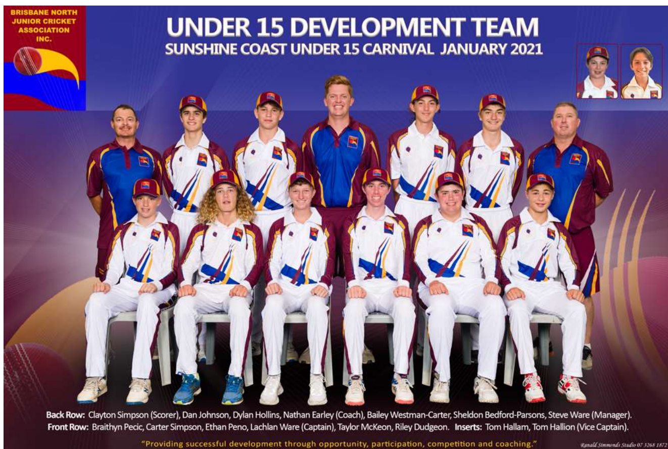
U15 Development team