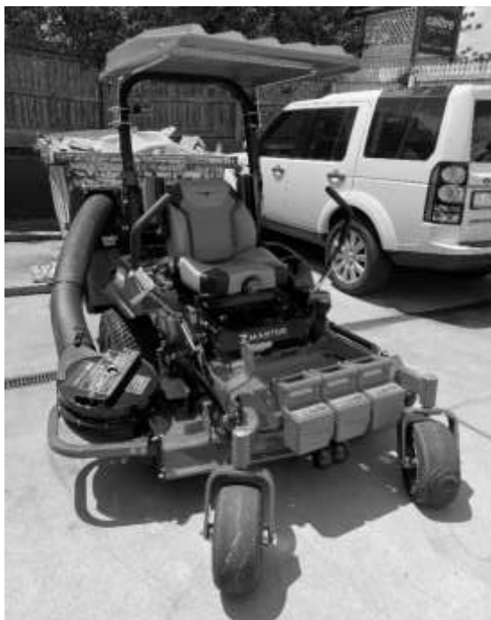
Our new mower, purchased to keep the Kalinga Park ovals in top condition.

Players and coaches will receive a 'Diggers Cup' lapel badge struck specifically for the event. Diggers Cup - We Remember