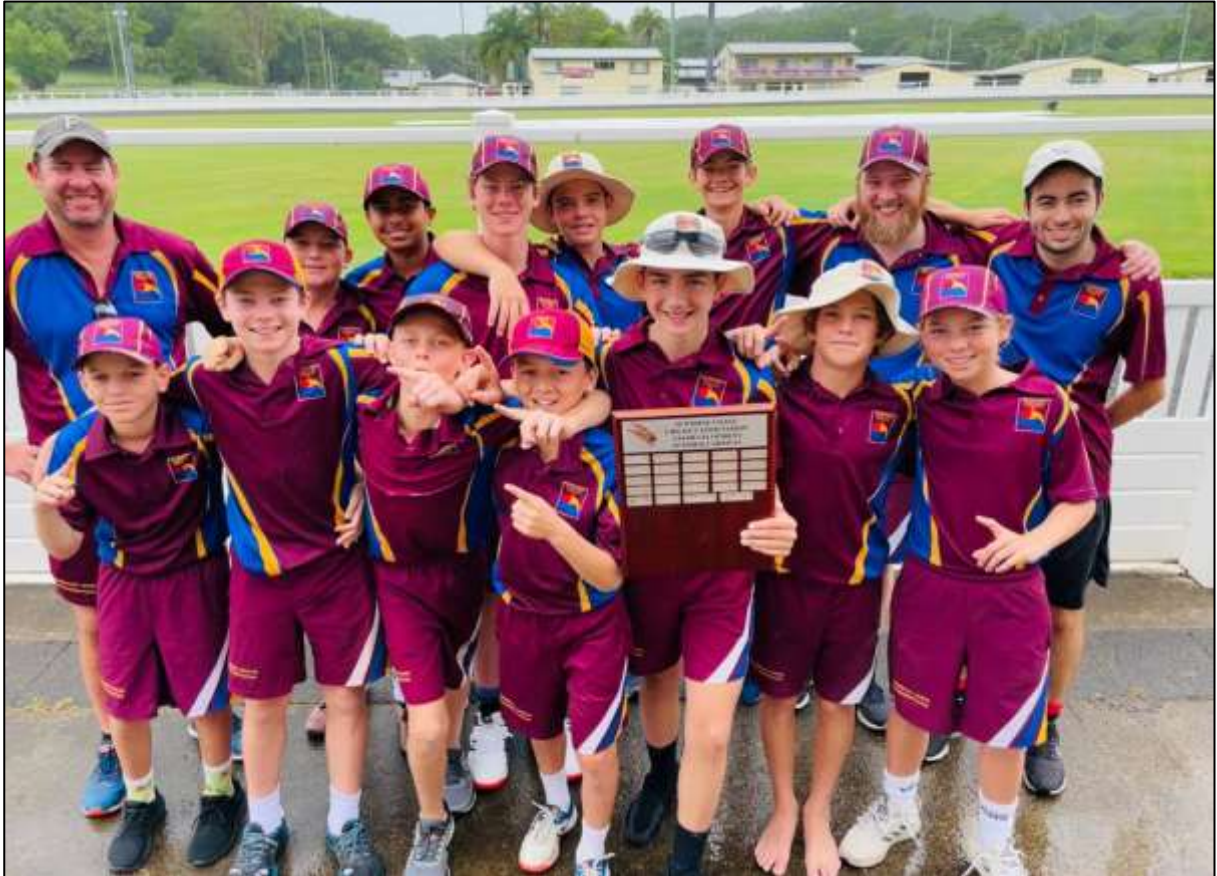
The BNJCA U14 Blue Sunshine Coast Development carnival winners