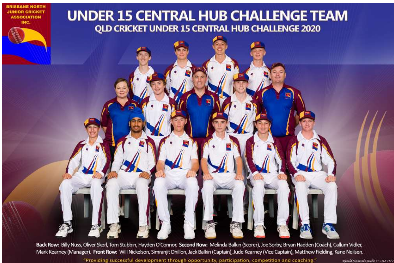
U15 Central Hub Challenge