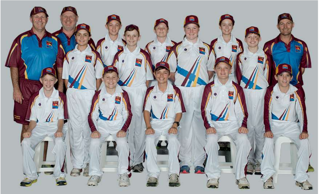
U13 Ipswich Development team