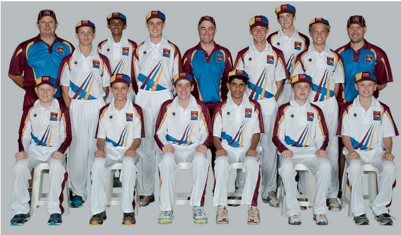
U14 Championship team