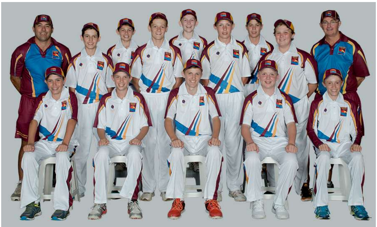
U14 Maroon Development Sunshine Coast team