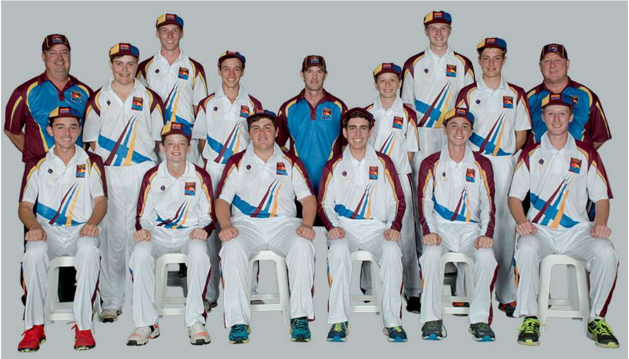
U15 Championship team