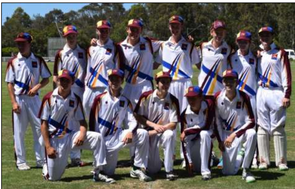
The U16 Championship team – winners of the last U16 State Championship