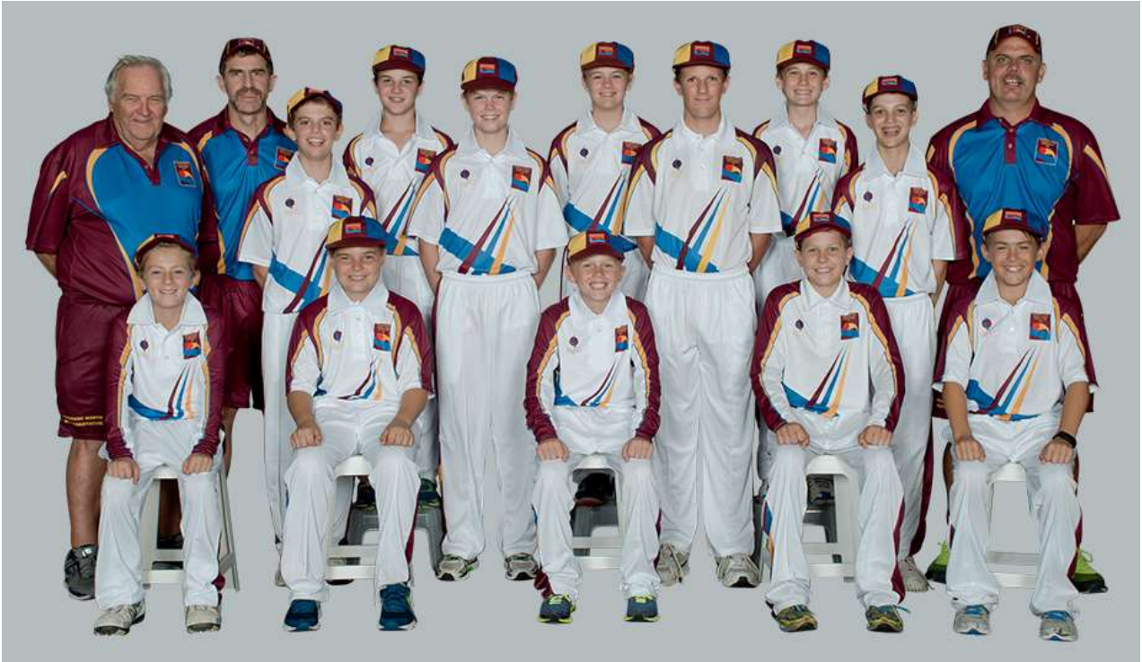
U13 Championship team