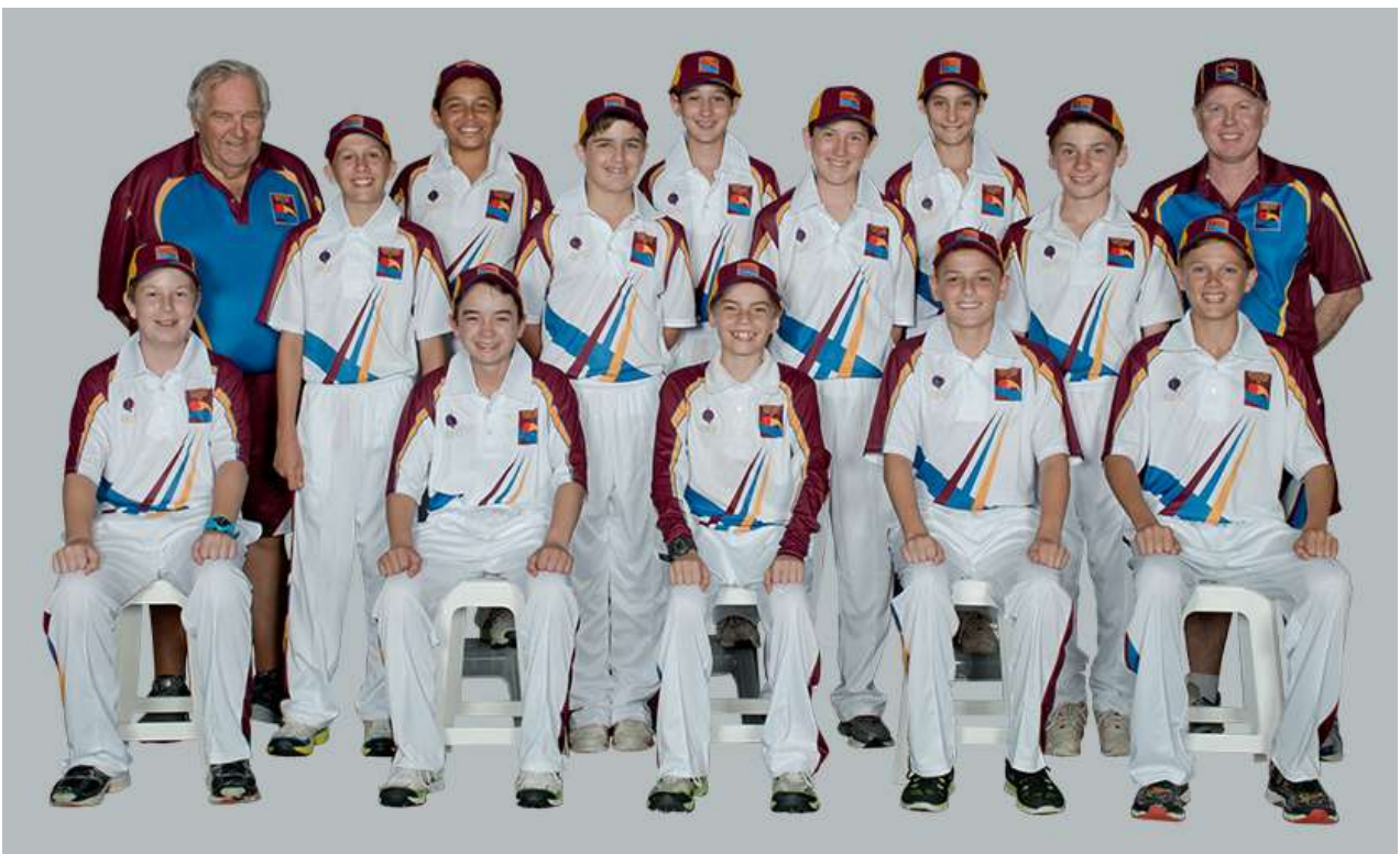
U13 Ballina Development team