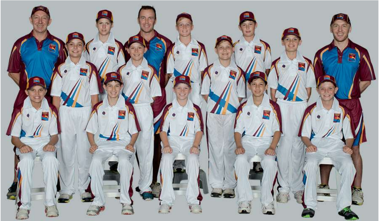
U12 Blue Development Ian Healy Cup team