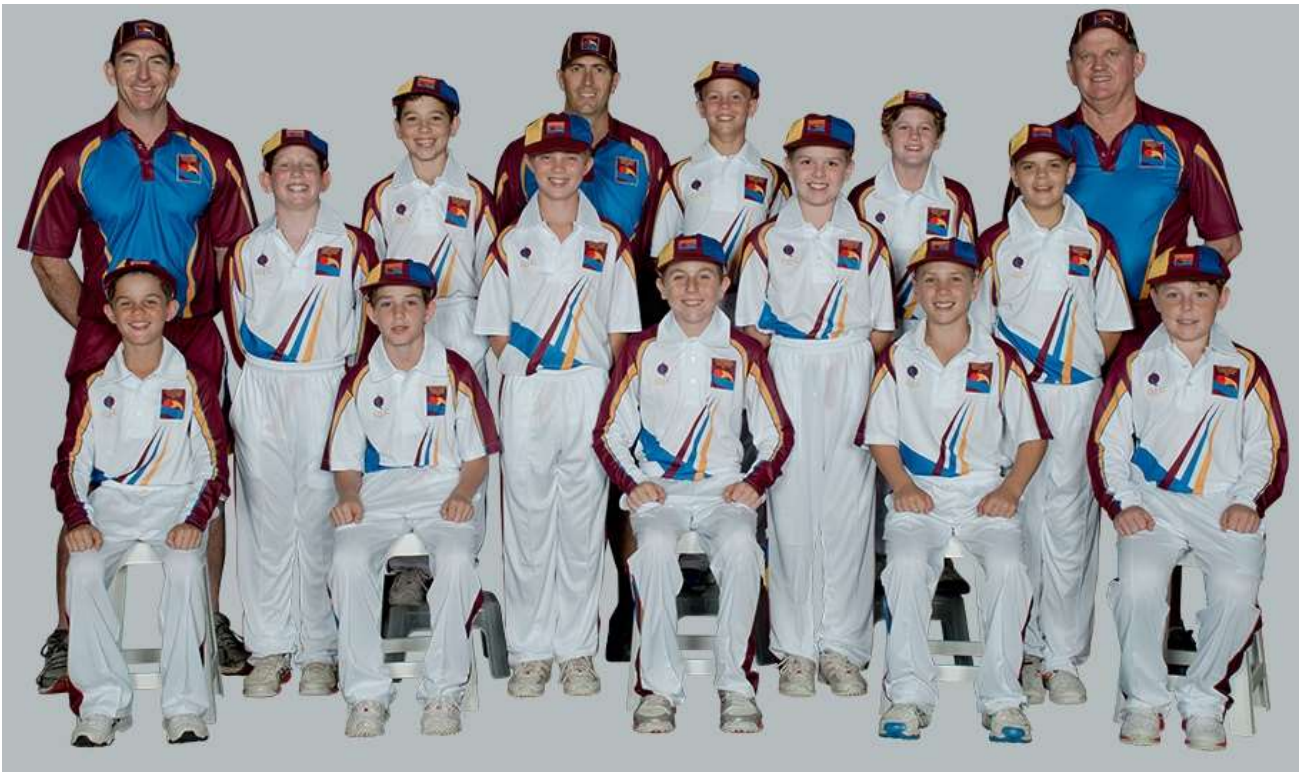
U12 Championship team