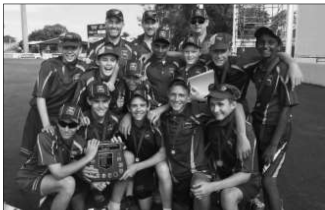
U14 Championship winning team

This year was the last U16 State Championship. Queensland Cricket has changed the representative pathway players move through to be a part of the U17 State team and higher levels of cricket. There is now an U16 Queensland Country Championship in Mackay where country players are selected for a final selection trial in Brisbane. The Brisbane players are selected through Lord Taverners, District Cricket and Shane Watson games. A total of 4 teams of selected players from the Country championships and Brisbane games then play 4 games over a week in Brisbane and from this, the U17 State team is selected.