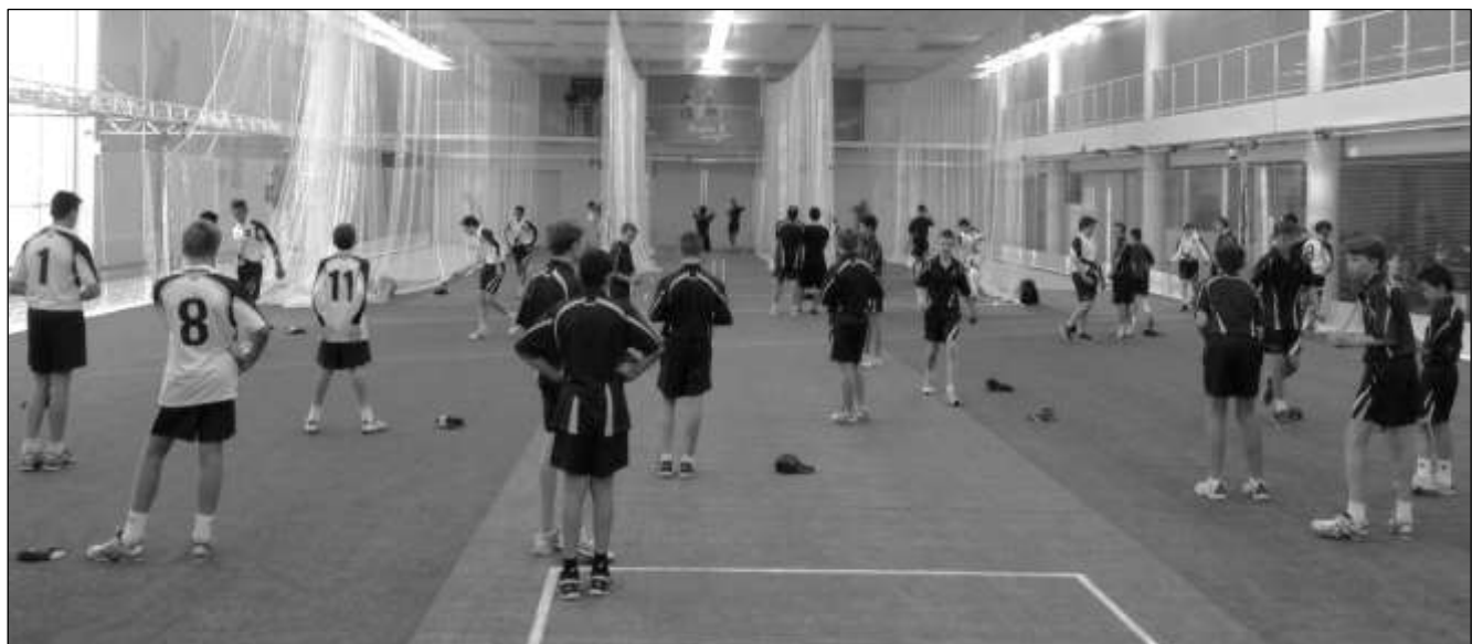
U13 & U14 Rep teams attended a night at the BUPA National Coaching Centre at Alan Border oval.