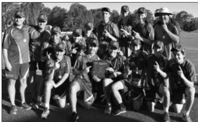
U16 Championship winning team