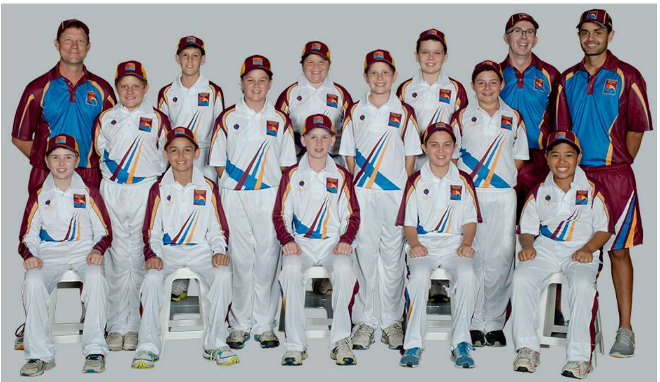
U12 White Development Ian Healy Cup team