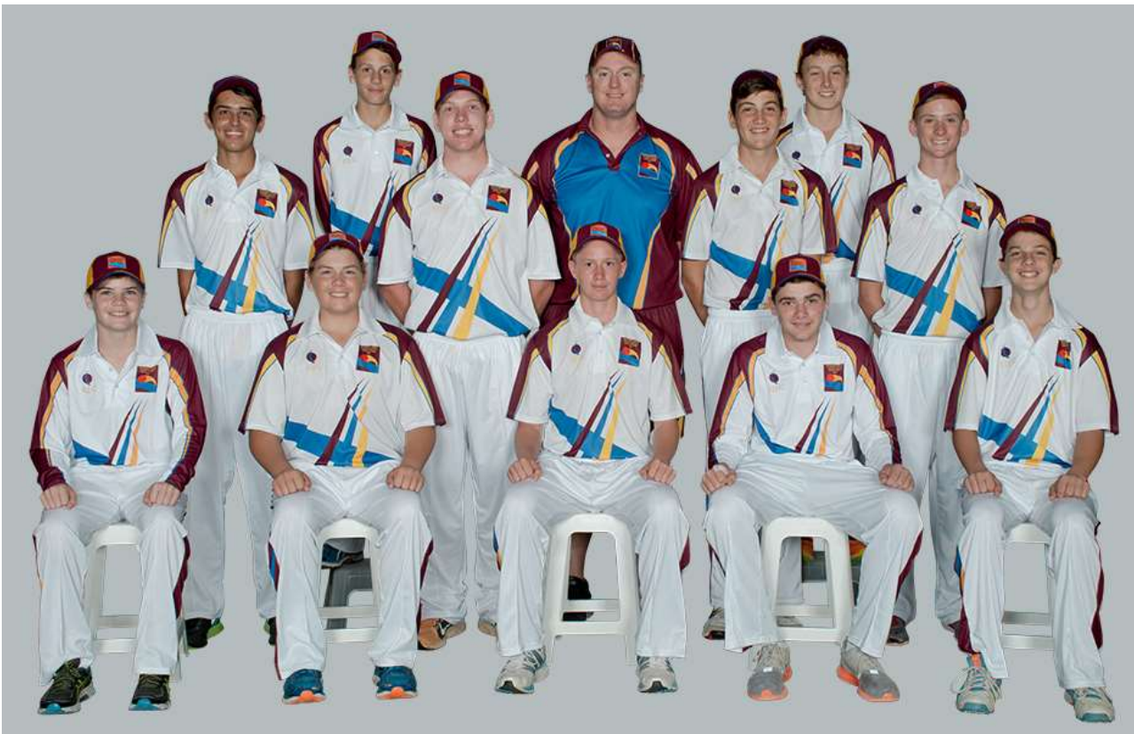
U15/16 Impact Challenge team