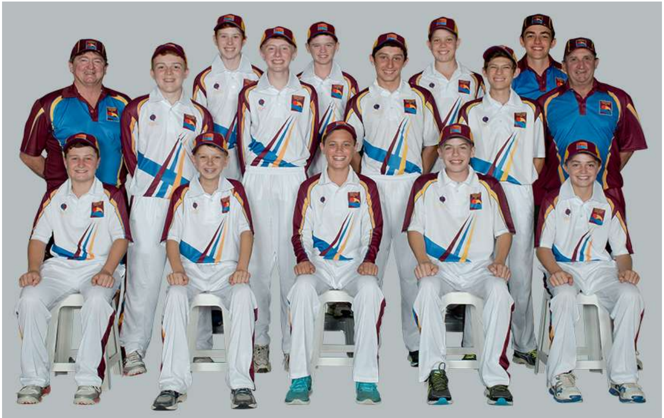
U14 Blue Development Sunshine Coast team