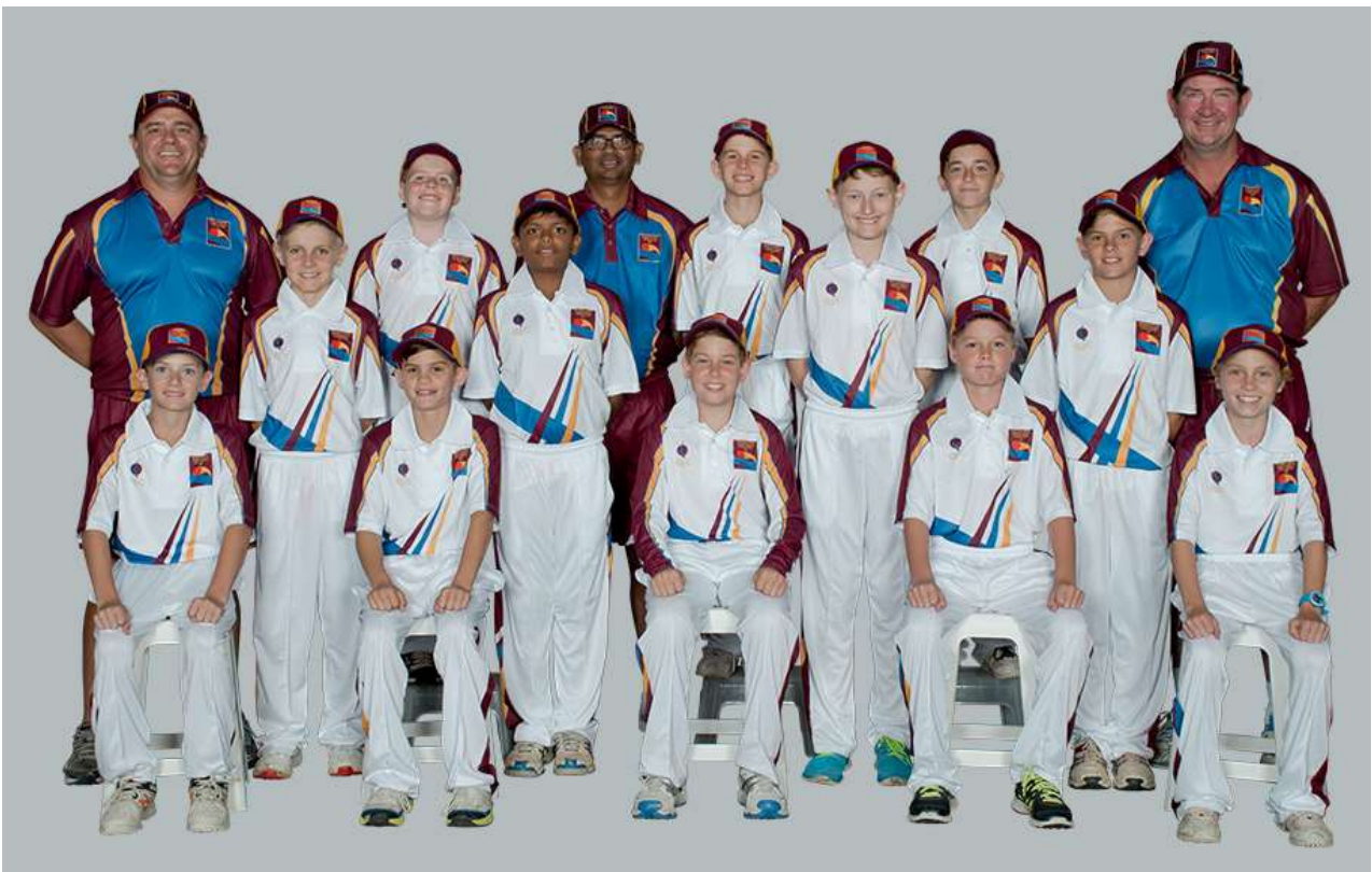
U12 Maroon Development Ian Healy Cup team