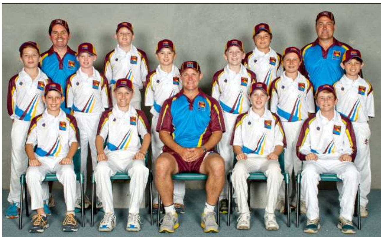
U12 Brisbane North Junior Cricket Association Development team