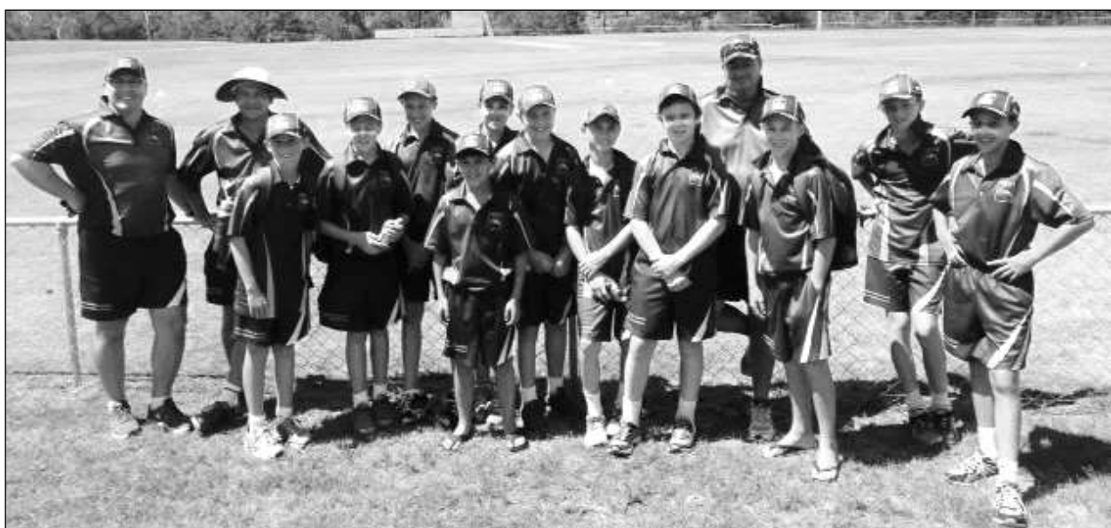
An U13 Development team, in their travel gear, played at Ipswich this year for the first time.