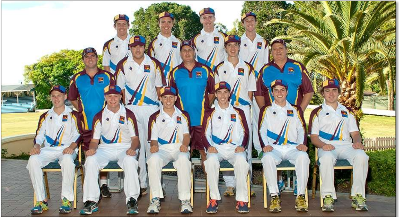
Winning U16 Brisbane North Junior Cricket Association Championship team.