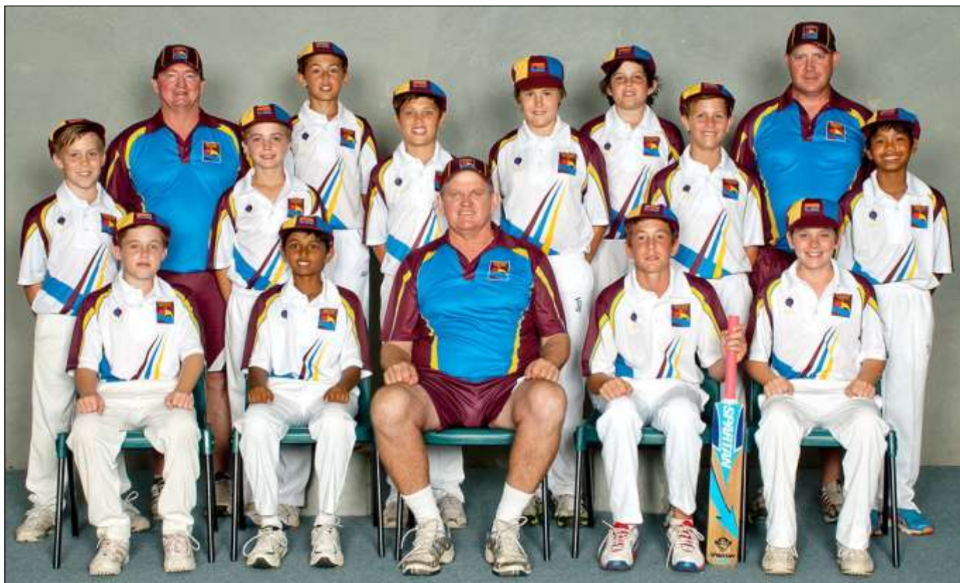
U12 Brisbane North Junior Cricket Association Championship Maroon team