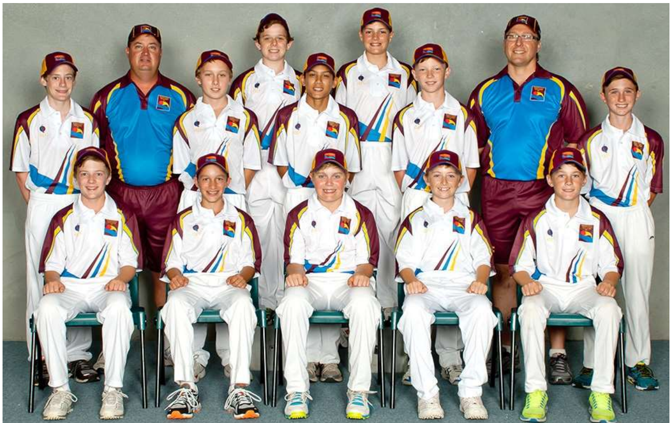
U13 Brisbane North Junior Cricket Association Development Ipswich team