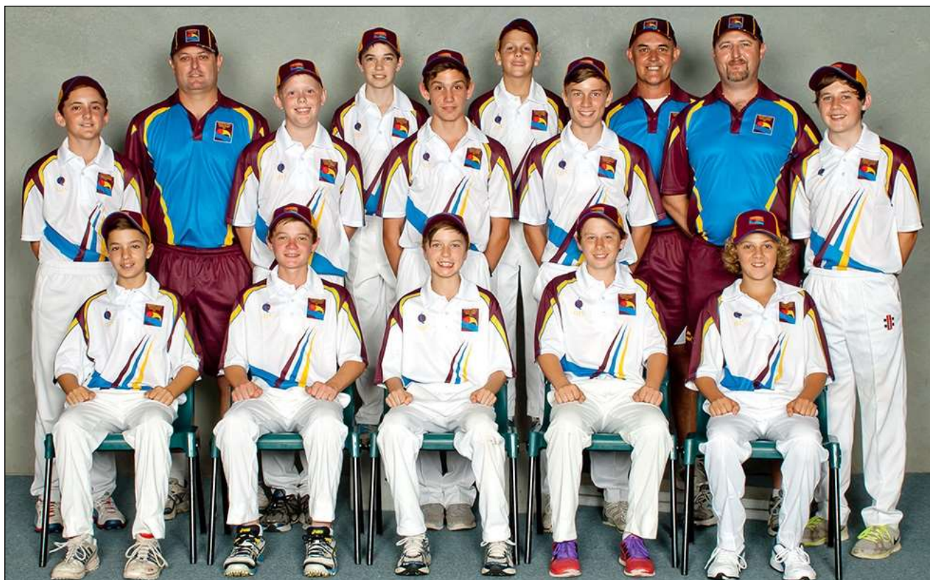
U14 Brisbane North Junior Cricket Association Development Blue team