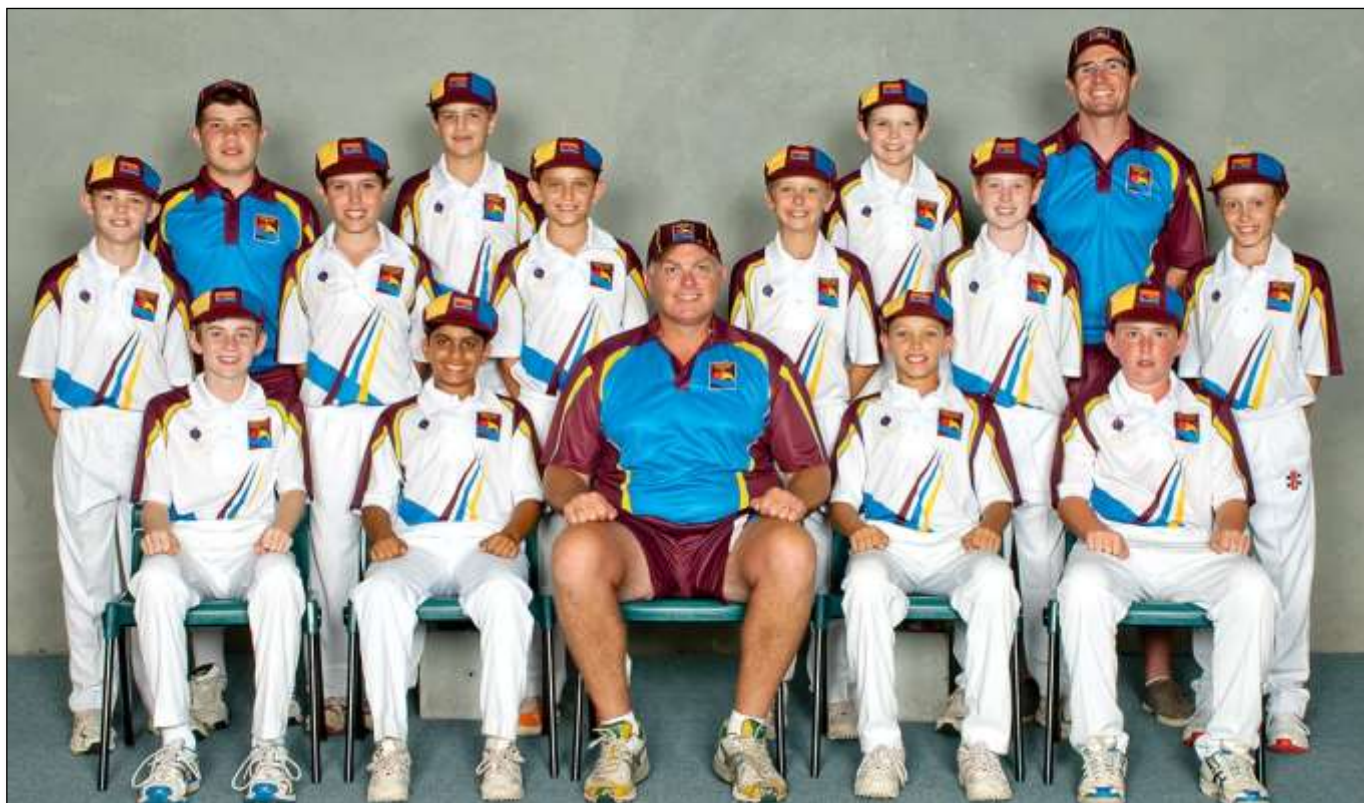
U12 Brisbane North Junior Cricket Association Championship Blue team