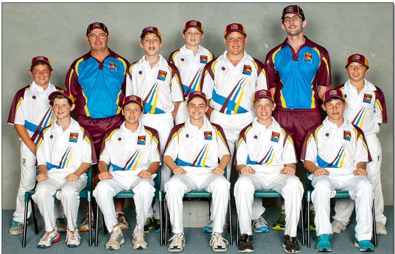
U14 Brisbane North Junior Cricket Association Development Maroon team