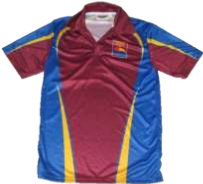
Players travel shirt