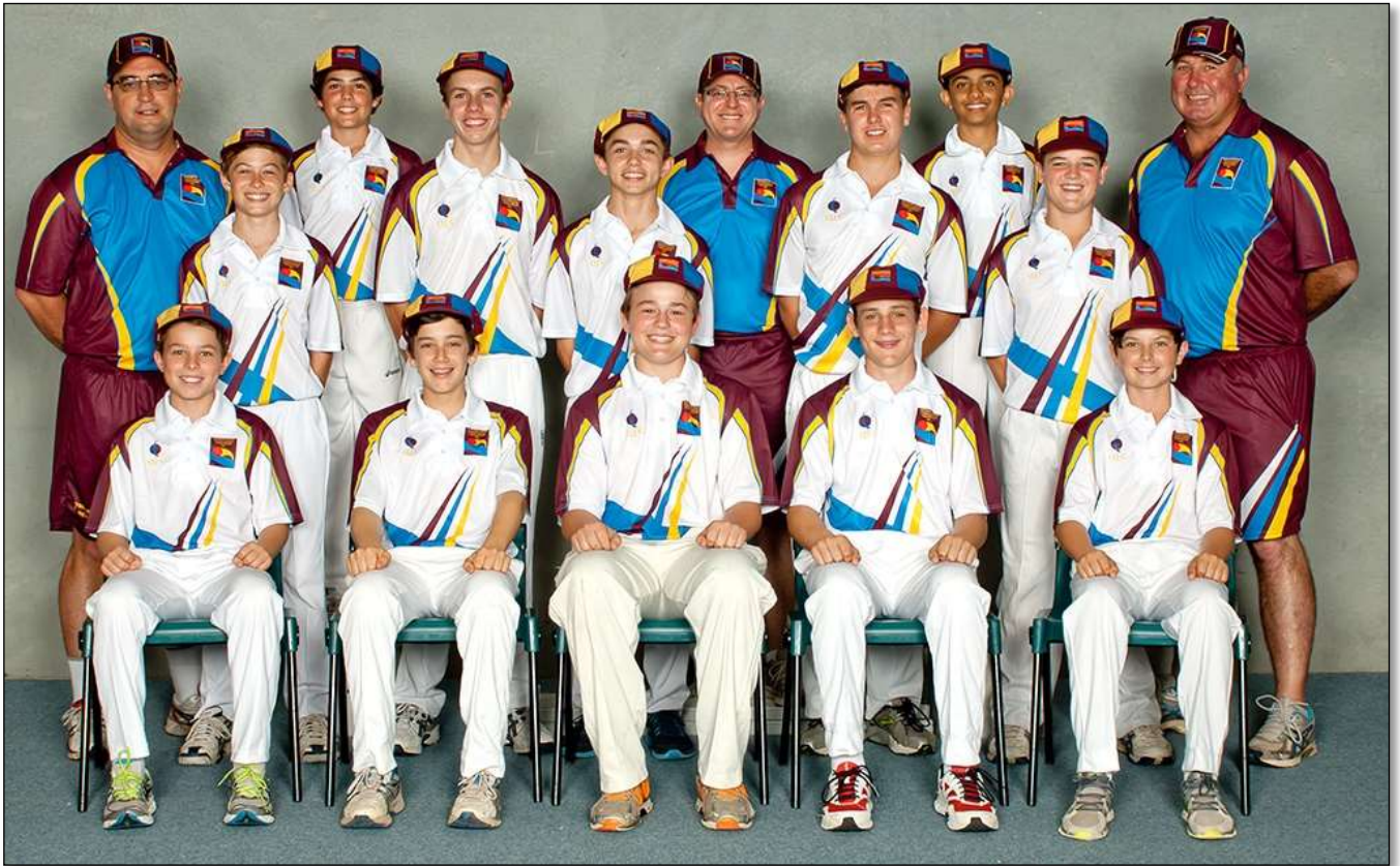
Winning U14 Brisbane North Junior Cricket Association Championship team