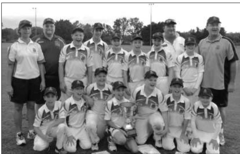
The Ipswich Team with BNJCA Secretary