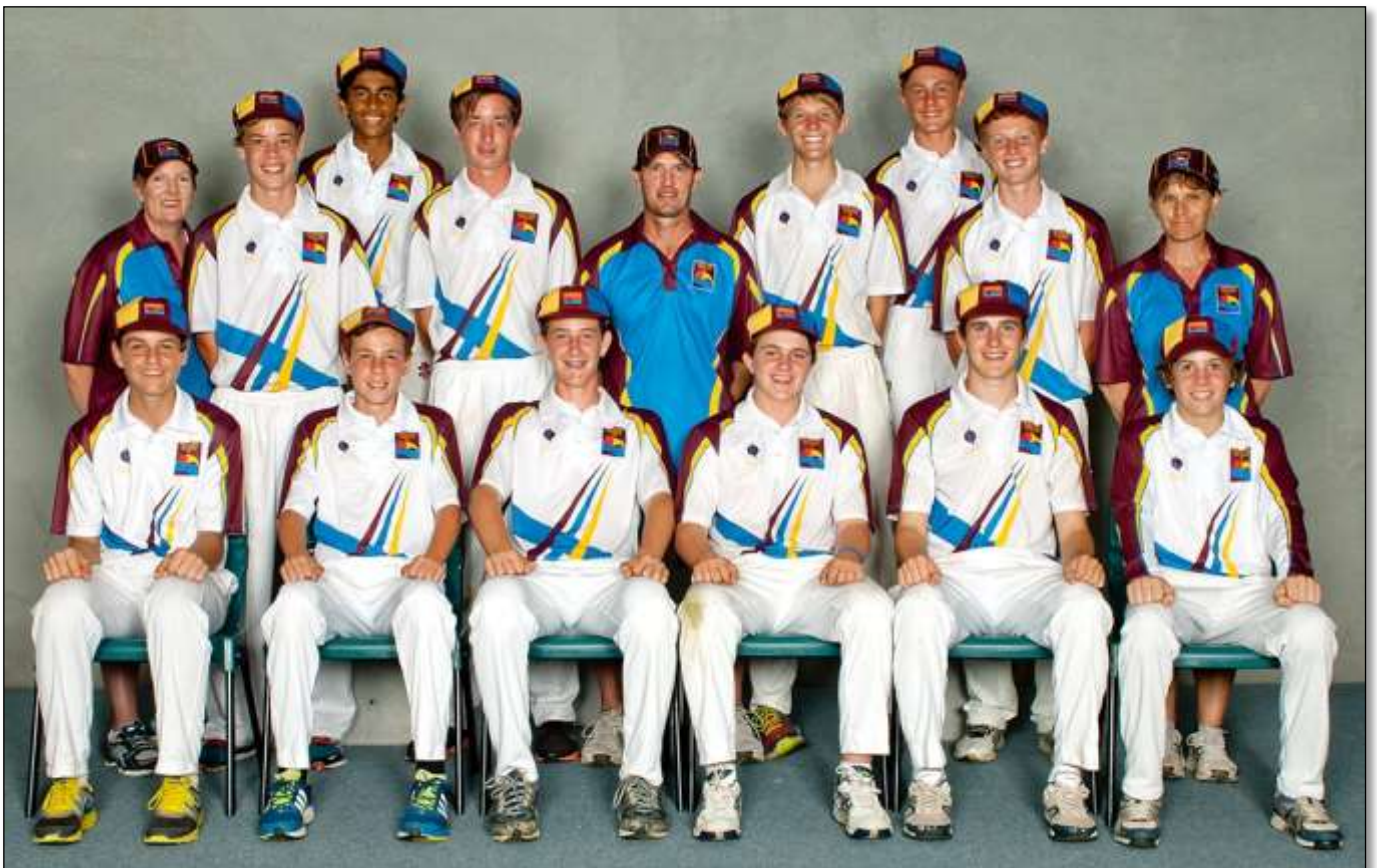
U15 Brisbane North Junior Cricket Association Championship team