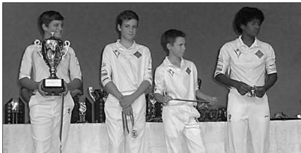
Winners of the U13 Love draw, Wilston North Green with the Ray Wonnacott Cup