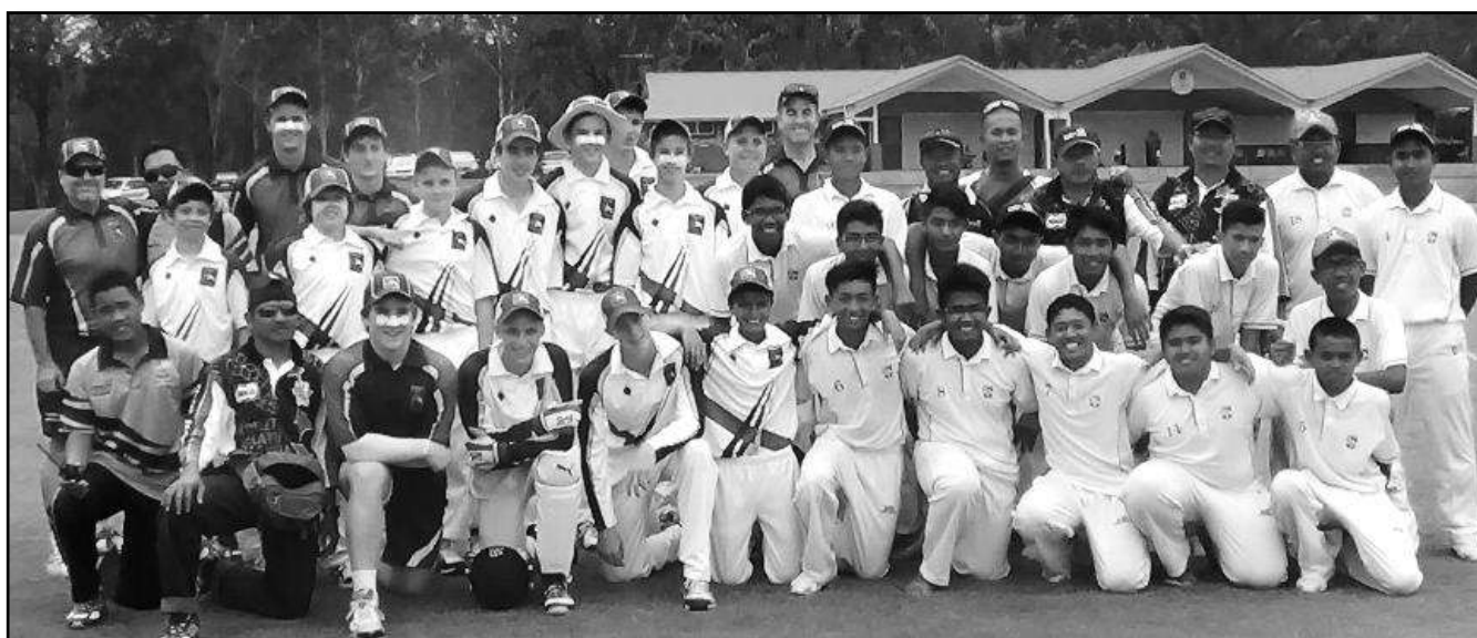
The U15 Development team participated in the Southern Skies carnival at Toowong and played against a Malaysian team and made some great mates on the day.