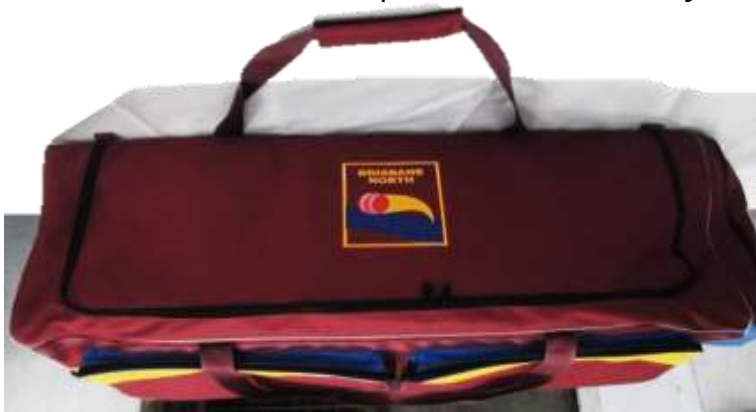
3 wheeled gear bags