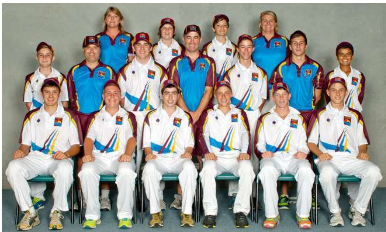
U15 Brisbane North Junior Cricket Association Development team