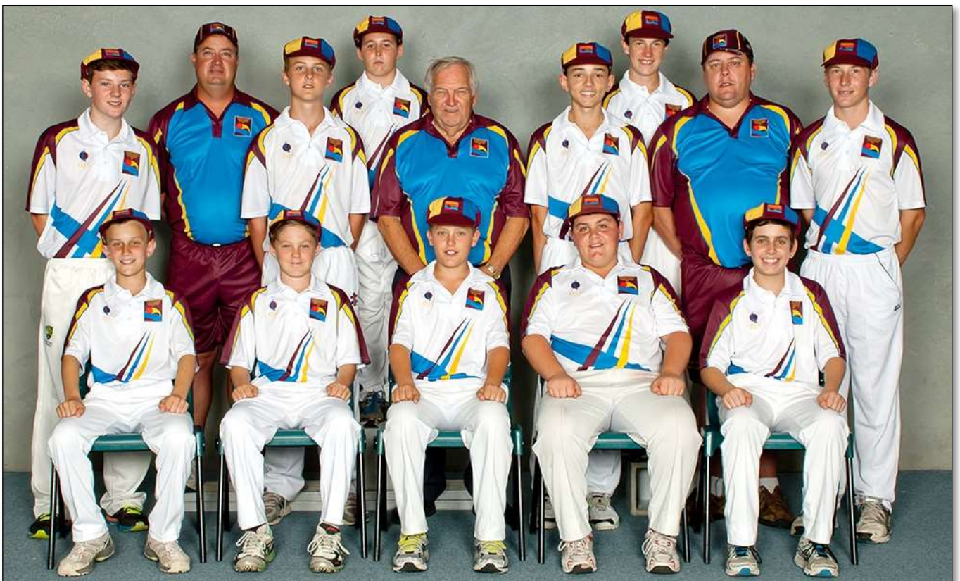
Winning U13 Brisbane North Junior Cricket Association Championship team