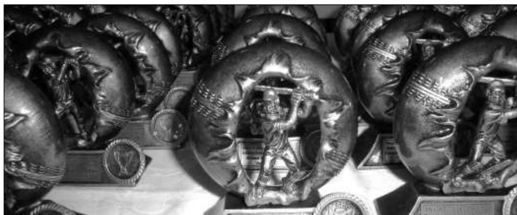
Some of the trophies for the Individual award winners.