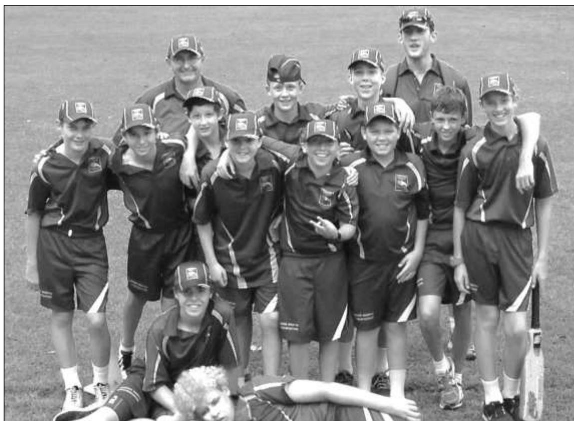
Runners -up – Brisbane North Maroon