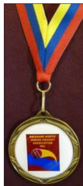
Brisbane North Junior Cricket Association Premiership medallions