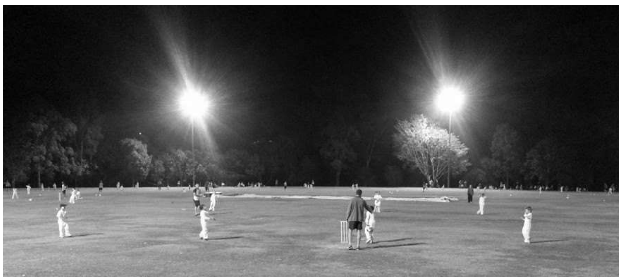
Super Sixes played on Friday night under lights at Albany Creek, Toombul & Valleys clubs.