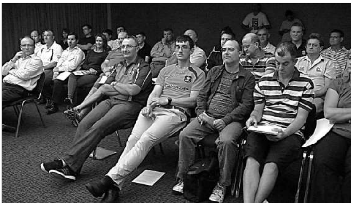
Some of the attendees at the Coach, Manager and Scorers night, held for our Representative officials