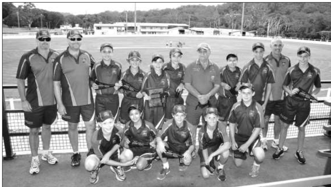
Winning team – Brisbane North Blue