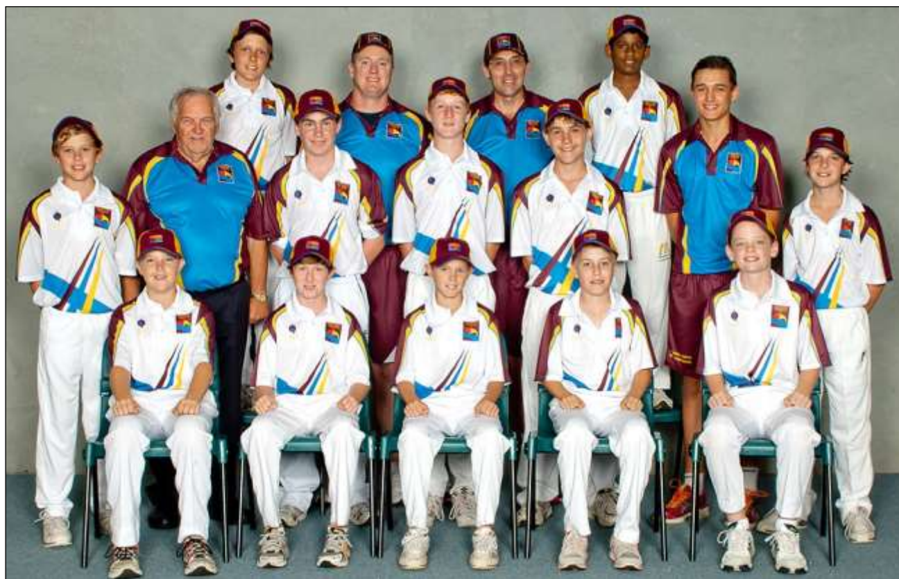
U13 Brisbane North Junior Cricket Association Development Ballina team