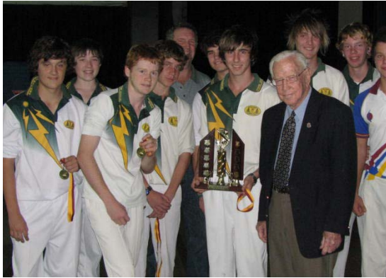
Under 16 Pine Rivers 96.46 points