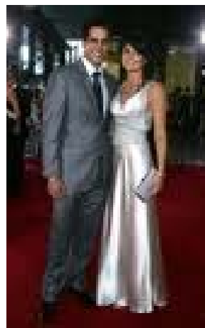
Queensland players at the Allan Border Medal ceremony