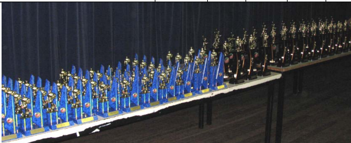
Some of the Trophies for winners at the BNJCA Trophy Night