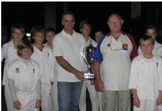
Under 13 Valley Green 112.08 points