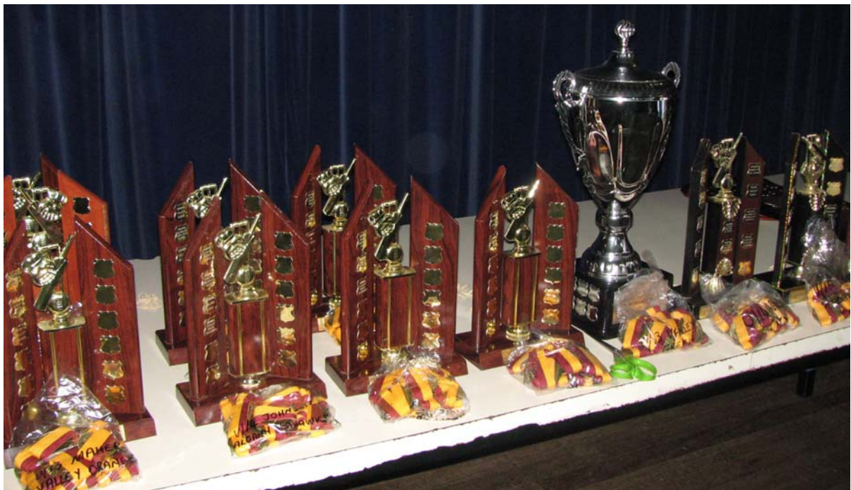
Premiership winning trophies