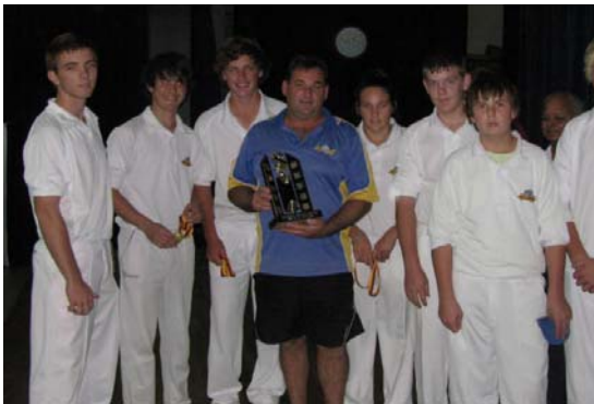
Under 15 Sandgate-Redcliffe Stackpoole 85.54 points