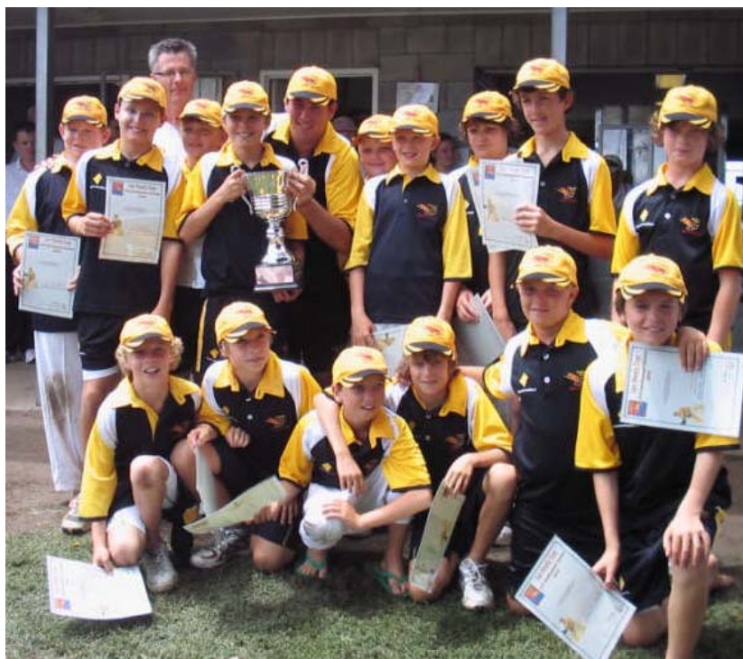
Sunshine Coast – winners of the 2010 Ian Healy Cup