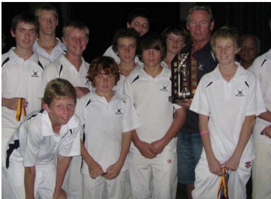
Under 14 Redcliffe City 95.44 points