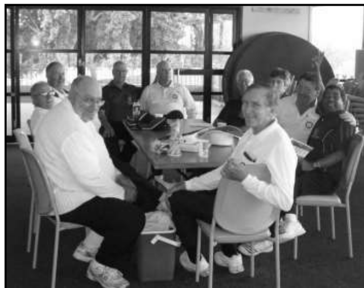
The umpires on a lunch break during the U16 Intra-State Championships, BGS grounds, Northgate